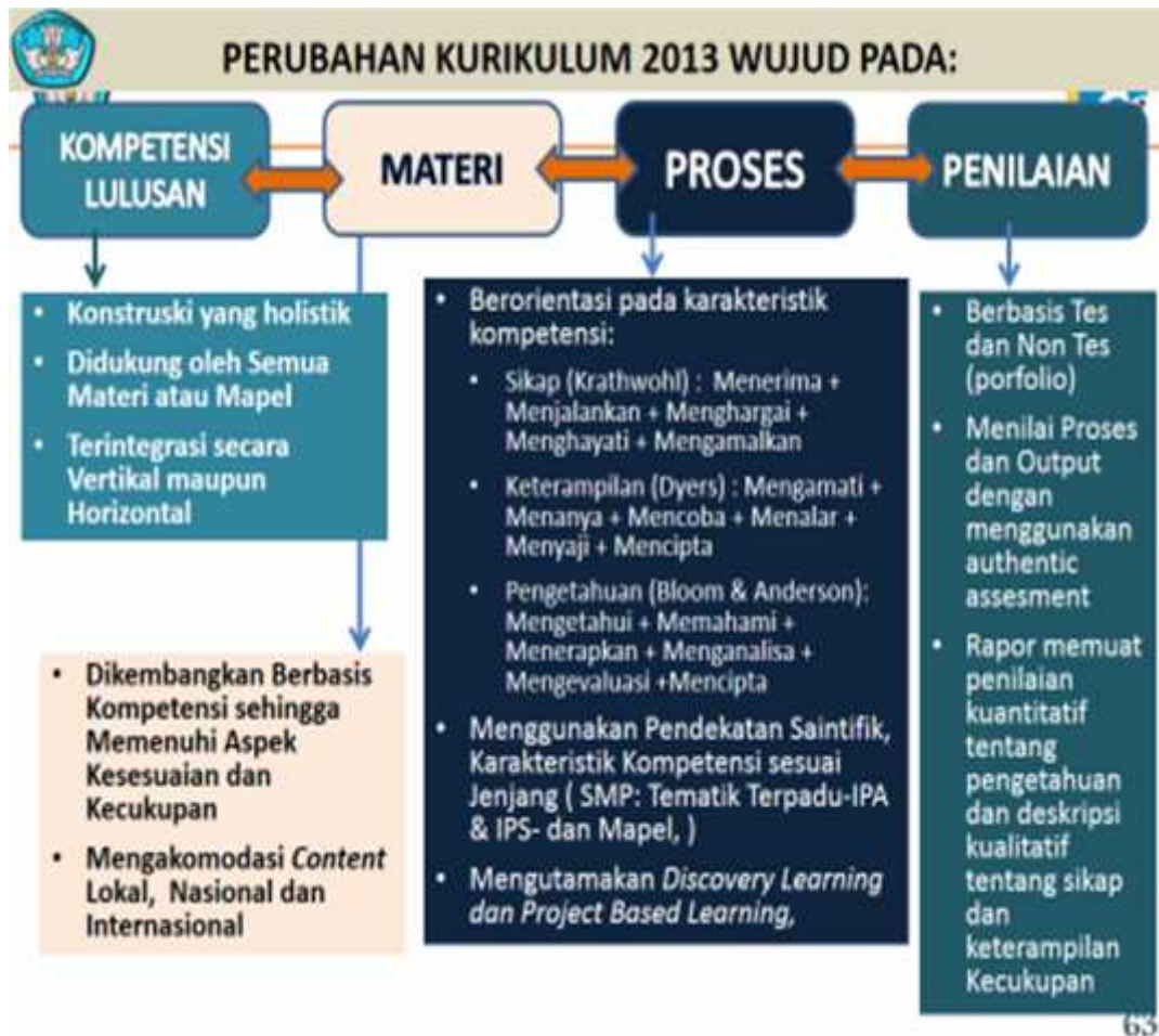
Table 3. The curriculum 2013 changes